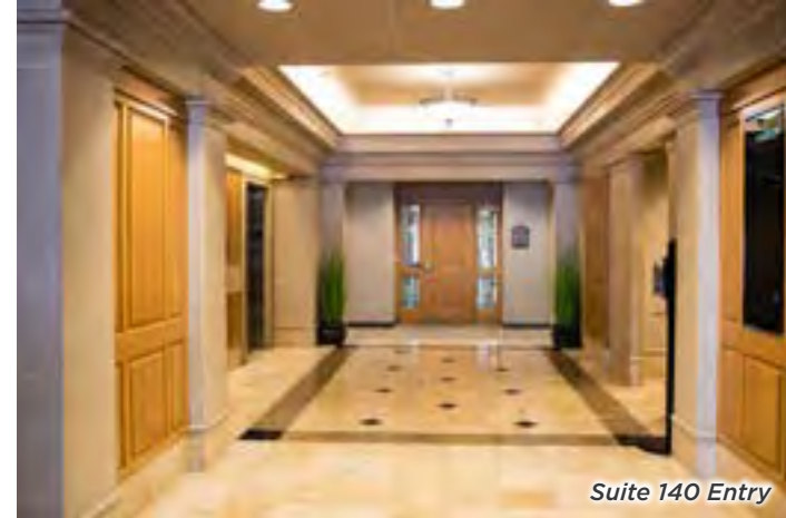
Suite 140 Entry