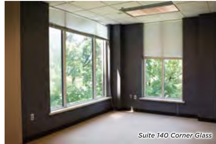
Suite 140 Corner Glass